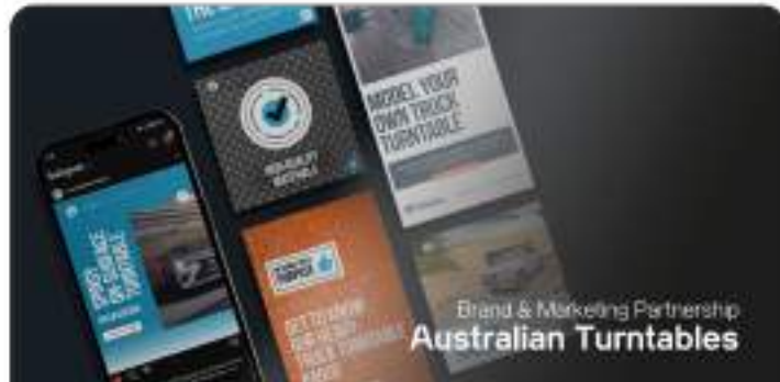
Brand & Marketing Partnership Australian Turntables