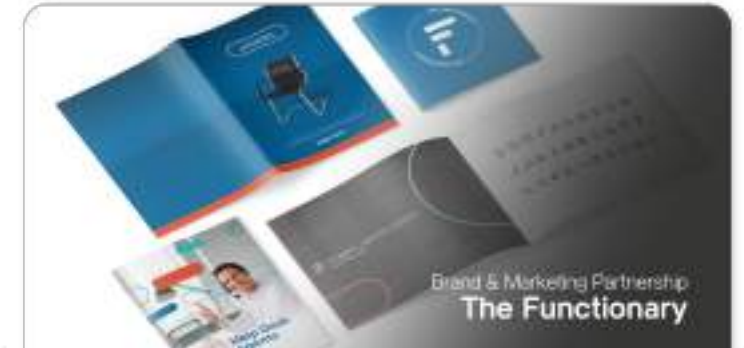
Brand & Marketing Partnership The Functionary