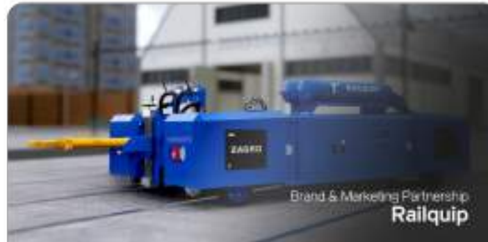
Brand & Marketing Partnership Railquip